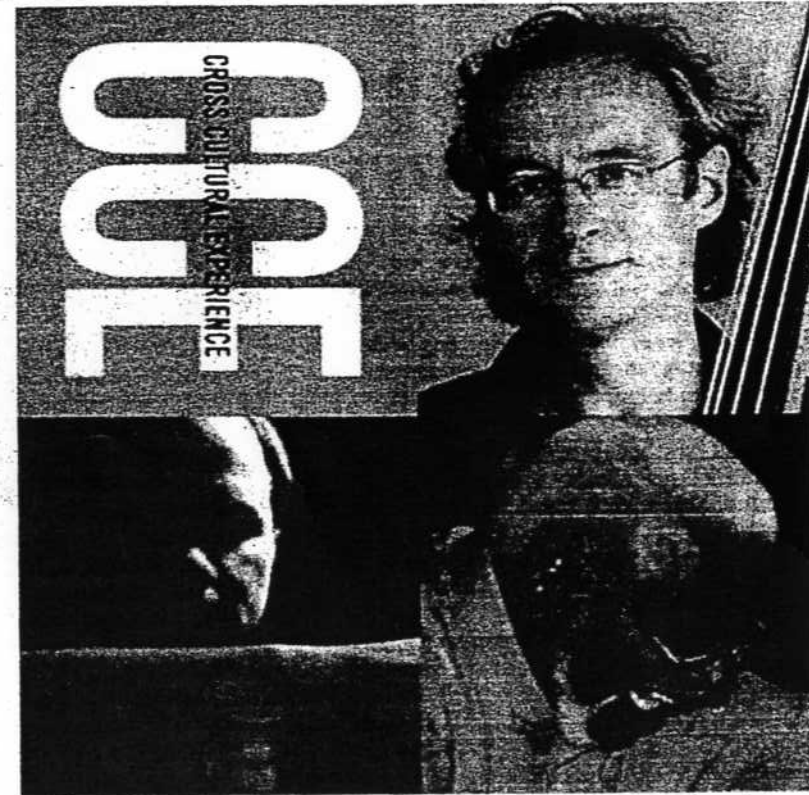
THE KITE DUO . . . coming to TT for a show and workshops

For further information or reservations, send an email to pr-10@ports.diplo.de or call 628-1630.