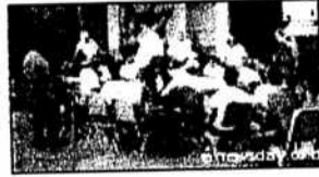
Members of Kite Duo surrounded by local musicians during a workshop at Bishop Anstey High School....